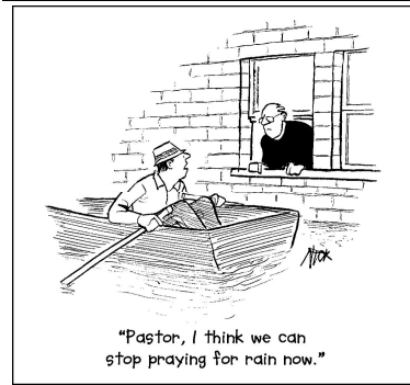
"Pastor, I think we can stop praying for rain now."